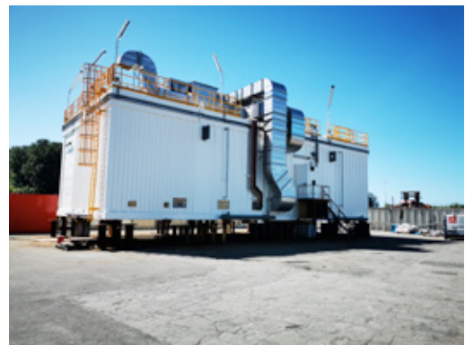
Schneider Electric - JOCAB (TOTAL) Absheron Early Production platform Electrical and Control Room E-House