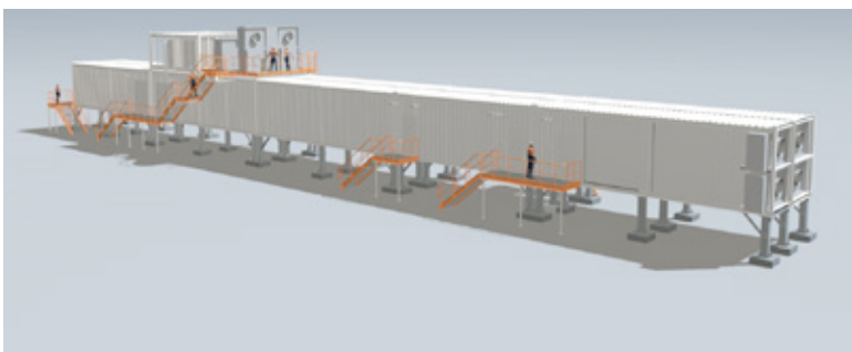
Schneider Electric - Turboden Palayan Binary Power Plant Project Phillippines Compressor.power and automation E-House