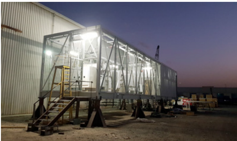
Schneider Electric – ADNOC South East TIE Project- PKG C N. 5 ELECTRICAL SUBSTATION

As a result, we have applied "smart manufacturing": a new way of understanding the "production of a good" starting from its design and arriving at delivery dictated by the need to transform companies and the