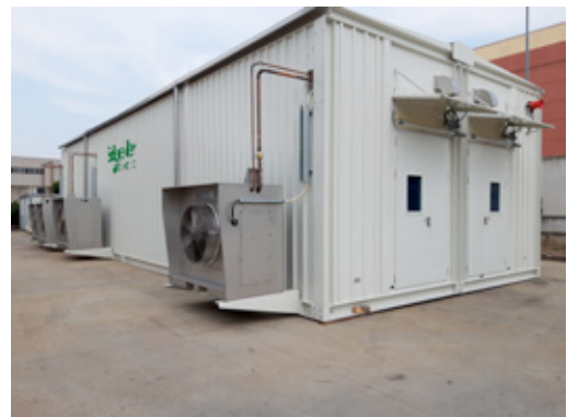
Schneider Electric - Tengiz Chevron Oil kz TCO Orken village UPS building